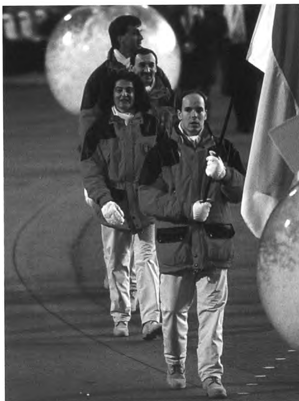
Grace Kelly (left); and Albert II (right), Prince of Monaco and grandson of John Brendan Kelly, Sr., who participated thrice in Olympic bobsleigh competitions between 1988 and 1994 and has been a member of the IOC since 1985.