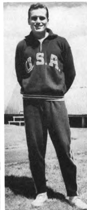
J. B. Kelly, Sr. (left) and J. B. Kelly, Jr. (right).

training and competing while only a fourth grade student at the Penn Charter School. 23 In an effort to tell a clear history of this compulsively busy “Jack” Kelly, Jr., as an Olympic athlete, the remainder of this section 3 is divided into: the London Olympics 1948; the Helsinki Olympics 1952; the Melbourne Olympics 1956, and the Rome Olympic Games in Rome 1960.