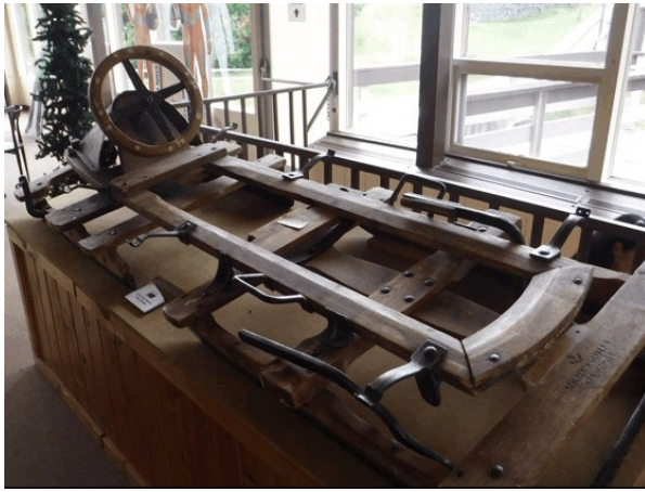
A 1930s era German-made four-man bobsled, on display at the Mt. Van Hoevenberg Olympic Sports Complex

first Olympic Winter Games Champion in the Men's 500m event in Chamonix in 1924. A granite marker dedicated on 9 July 1983 near the edge of Mill Pond commemorates Mr. Jewtraw and his achievement.