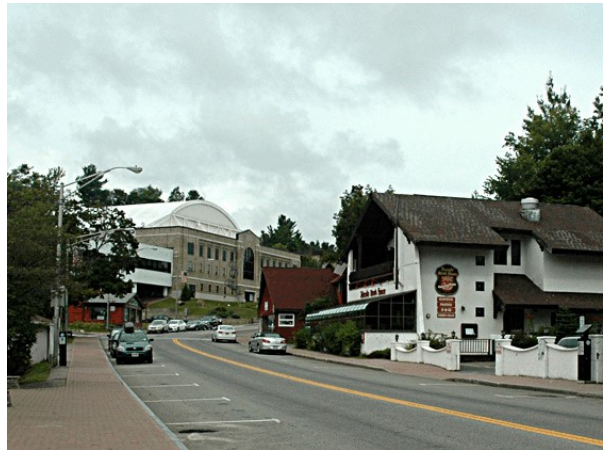
The town of Lake Placid with barrel vaulted roof of the 1932 Jack Shea arena in the background.

The largest foreign delegation to the Fair came all the way from the People's Republic of China and consisted of 14 individuals -- 4 of whom represented the China Sports Museum in Beijing.