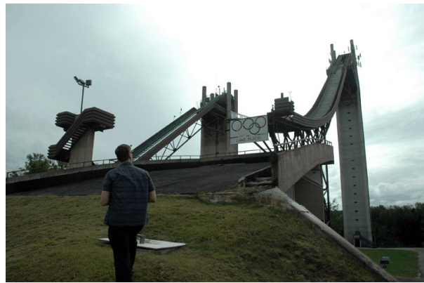
The 1980 Olympic Winter Games Ski Jumping Complex at Intervale

Other highlighted events in the Olympic Center during the weekend included a reception in the 1932/1980 Lake Placid Olympic Museum on Friday evening, the 11 th ; a general meeting of the newly-formed Association