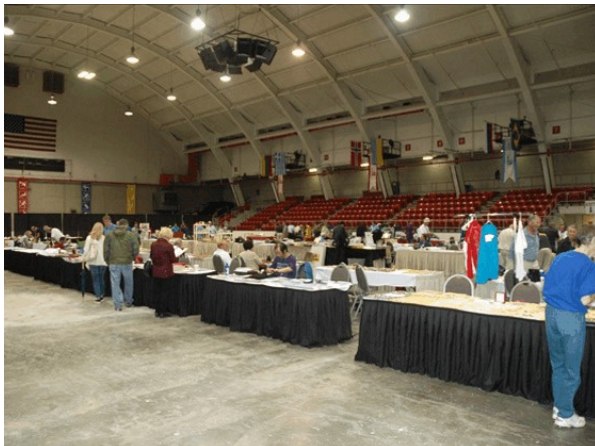
The World Olympic Collectors Fair featured 62 collectors from 16 countries trading and selling.

The venue for the 21st World Olympic Collectors Fair was made all-the-more special by its proximity within the Olympic Center to the 1980 Olympic Rink -- now known as the "Herb Brooks Arena" -- where the "Miracle on Ice" occurred on 22 February 1980. It was there that a young group of mostly-collegiate ice hockey players from the USA defeated the mighty Soviet Union 4-3 in a semi-final game, then went on to win the gold medal with a 4-2 victory over Finland in the final. Needless to say, many of the Fair attendees made the short walk to this historic arena which is still in use today.