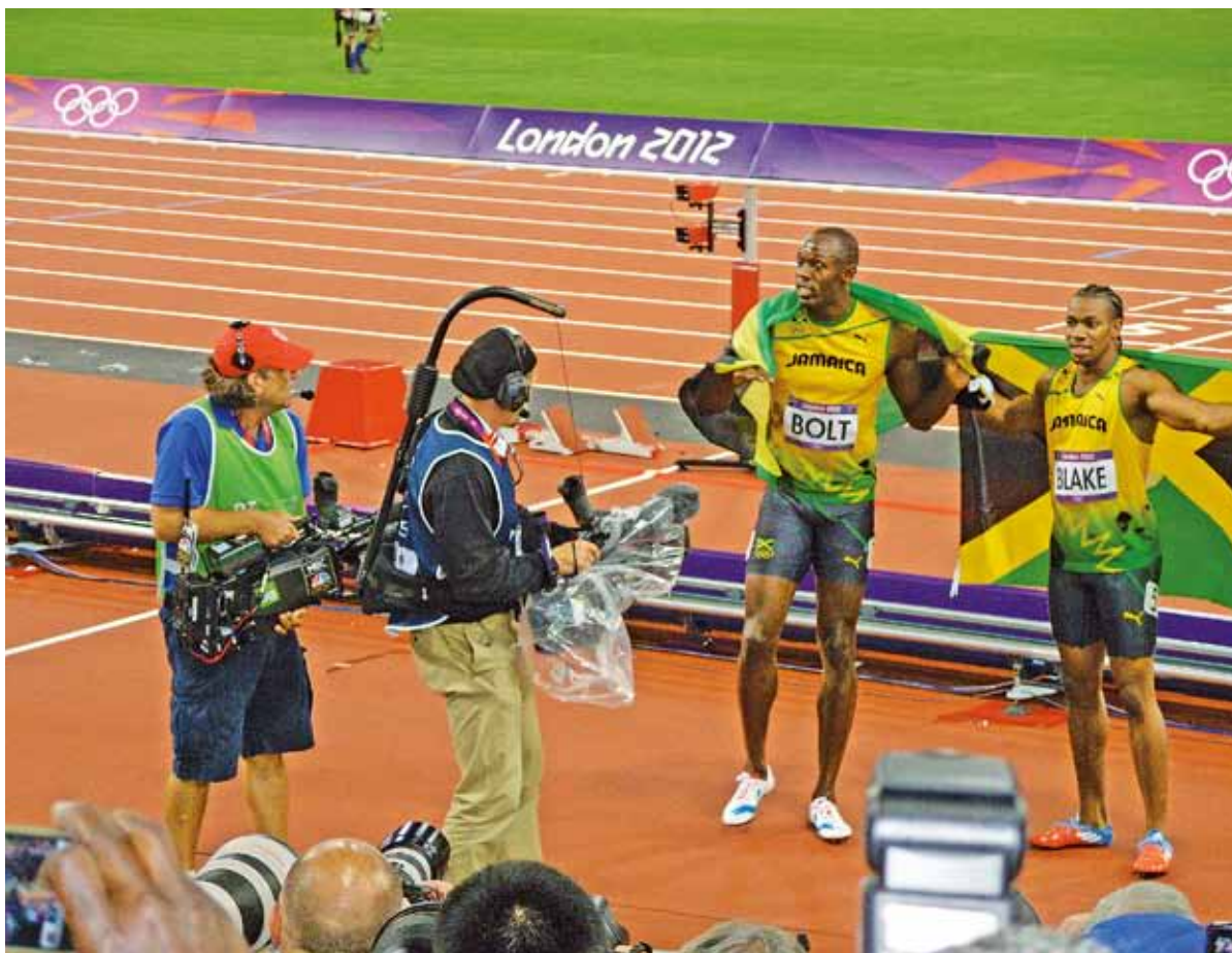
Total TV: the permanent presence of television led to a completely new type of presentation of the athletes. The photo shows London 100 m gold and silver medallists Usain Bolt and Yohan Blake from Jamaica as they took their lap of honour, accompanied throughout by television cameras.

fifties, to "Information media" in the mid-seventies and "Mass-Media" by the late seventies. Other titles included "Mass-Media-Publications-Copyrights" in the early eighties to "Mass-Media: graphic impression, sound and/or vision recording and electronic broadcasting" in the mid-eighties to "Media Coverage of the Olympic Games" from 1991 onwards. A shift from a technical approach to a more precise approach in the rule is foreshadowed by the title. But perhaps the IOC's true goal is best reflected in the word "publicity" used from 1958-1974. The IOC craved positive attention and went about seeking it. The current title "Media coverage of the Olympic Games" shifts the accent from the sender of the message to the medium, in this case mass-media.