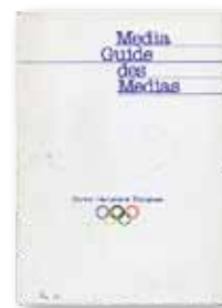
The 1984 Media Guide, published by the IOC, in which the requirements for the work of the mass media at the Olympic Games and meetings of the IOC were established.

In 1985, the Executive board looked at the media rules again. The text was consolidated in one section. Accreditation was to guarantee access to Olympic events 35 but, as in previous editions, indicated that athletes, coaches, press attaches and other accredited personnel were not allowed to perform as journalists. The rule remained unchanged until 1991, when the Charter underwent a complete overhaul of its structure. It was the result of an eight-year long process and a response to the evolution of the Olympic Movement.