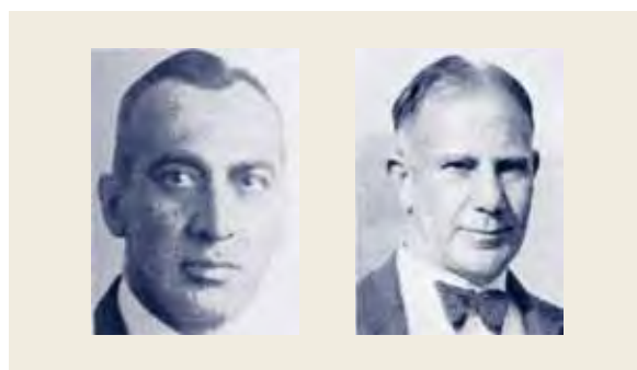
US Head Coach Lawson Robertson (far left) and Assistant Coach Dean B. Cromwell were responsible for team selection in the 4x100 m.