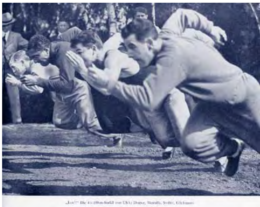
Photo from the German 1936 Official Report with the subtitle "'Come on!!' The 4x100 m relay team of the USA: Draper, Metcalfe, Stoller, Glickmann."

The circle closed in the summer of 1985 – a few weeks after Stoller's death – when Glickman visited Berlin for the first time for 49 years and visited the Olympic Stadium. On the tablets of honour at the Marathon Gate he read the list of gold medallists, which begins with the name of Jesse Owens, who had died of cancer in 1980. In the same year Frank Wykoff also passed away. Both outlived Ralph Metcalfe by two years, while bomber pilot Foy Draper had not returned from a Tunisian battlefield in early 1943. As Robertson, Cromwell and Brundage had long since passed away, with the exception of Glickman there was no living direct participant, which gave "a feeling of completion" as the last survivor. 32