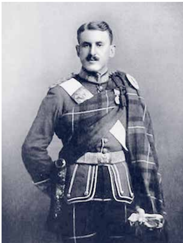
Captain Wyndham Halswelle in the uniform of the Highland Light Infantry. He was killed on 31 March 1915 near Neuve-Chapelle, France. Right: His gravestone at Royal Irish Rifles Graveyard, Laventie, Departement du Pas-de-Calais, Nord-Pas-de-Calais, France.

The rise to the front rank of athletes of that "Flying Scotsman," Lieutenant W. Halswelle, has been phenomenal. A couple of years ago he was practically unknown, and now he has broken the record at the Stadium for the 400 metres flat race. 39