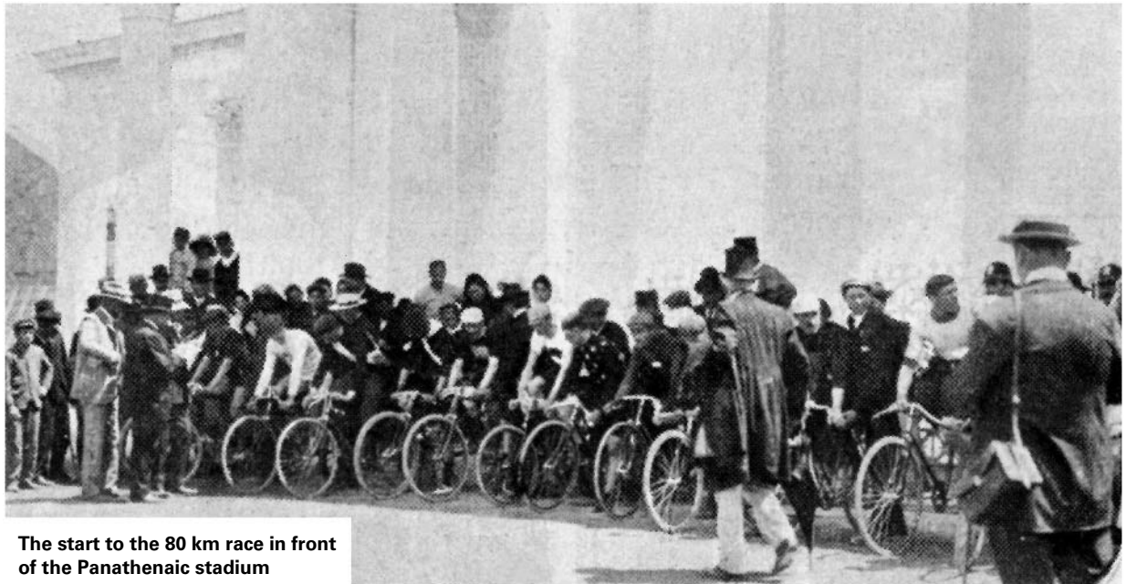
The start to the 80 km race in front of the Panathenaic stadium