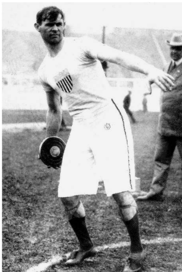
The most outstanding US-American athlete of the 1906 Games: Martin J. Sheridan

Still, SHERIDAN'S Olympic fame rests primarily on winning the Olympic gold medal in the discus in 1904, 1906, and 1908. He set at least six world records with the discus, although the status of world records in that era was quite variable. His first world record came in 1902 and his last was 141-4½ which he set shortly before his retirement in 1911.