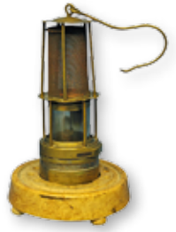
The legendary Saarland miner's lamp. Below: IOC President Edström informed the Executive Committee in 1948 before the London Games of a visit from the French Ambassador in Sweden. As no sports associations had yet been constituted, Saarland had to be patient until 1952.

Since Coubertin's time, the IOC had favoured their own 'sporting geography' (As a result of this Bohemia, which belonged to Austria, and the Grand Duchy of Finland, at that time still a part of the Russian empire, was permitted take part in the Olympic Games from 1906 to 1912). Whatever: now the Saar NOC was accepted. The West German NOC's claim to represent all German territories