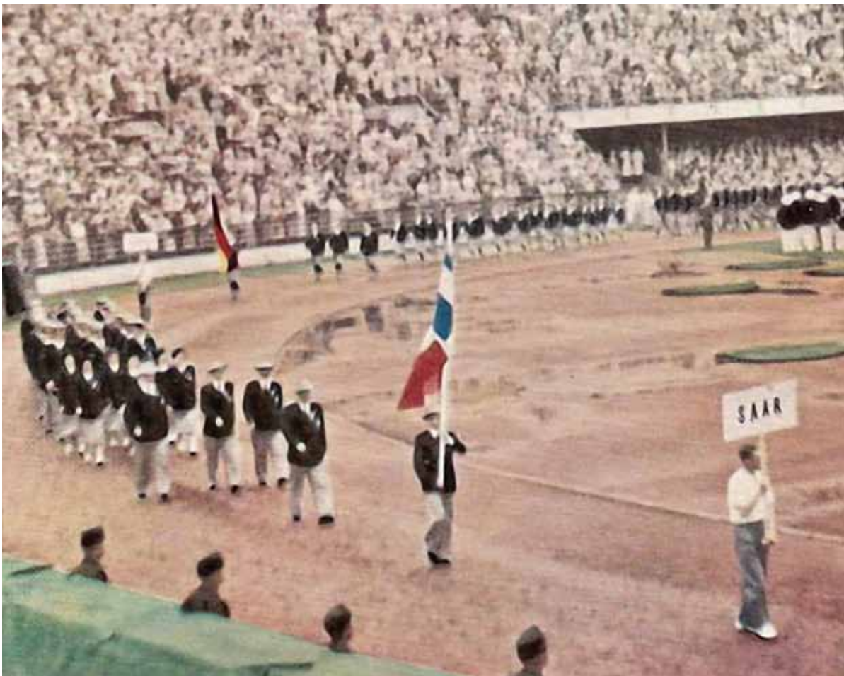
The most emotional moment. The entry of the Saarlanders to strengthen national identity.

Although the Saarlanders had been drawn against Austria in the elimination round, their football team was then withdrawn. Officially the reason given was financial, but was probably a pretext. After all the government had guaranteed the participation of all