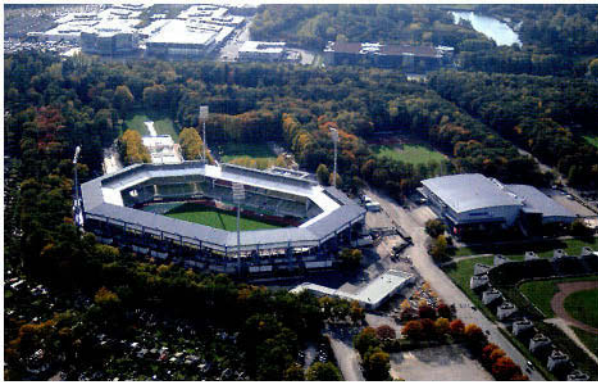
The Stadium in 2006