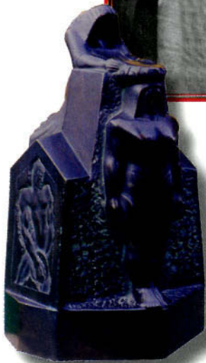
Sports Sculpture II: Crowning of the Contender