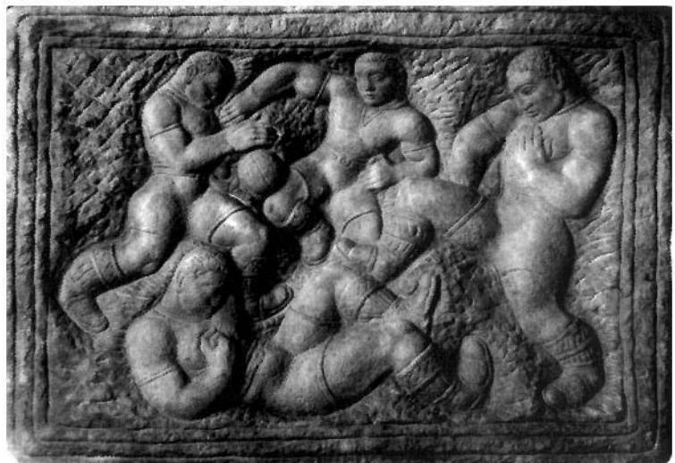
Ball (Silver Medal 1936)