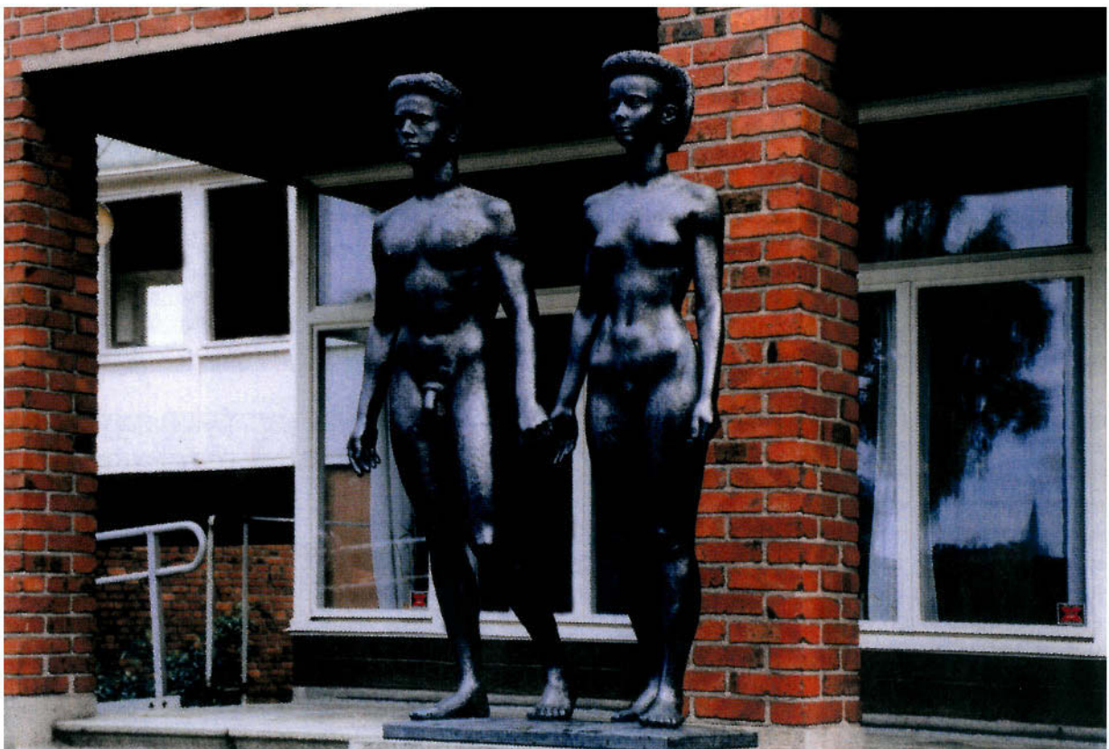
Gustaf Nordahl - Homage to Ling

The jury for the sculpture section of the Olympic art interpreted the competition rules in a liberal fashion because although freedom of expression is allowed, the rules expect some sporting context for the representation of the human form. His medal-winning work Homage to Ling is convincing through the modesty of the expression in the characters and all relinquishment of heroic attitude. The two figures portray an almost Greek humility and serenity. The double sculpture shows a young boy and girl who calmly move forward, holding hands. No relation to sport is apparent, but it represents a metaphor of the Olympic ideal of peace and understanding. (WZ)