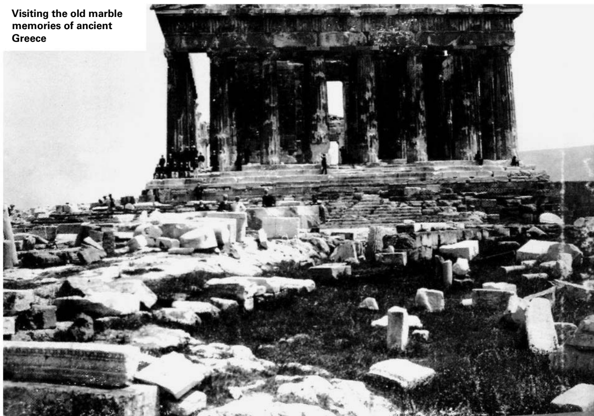
Visiting the old marble memories of ancient Greece