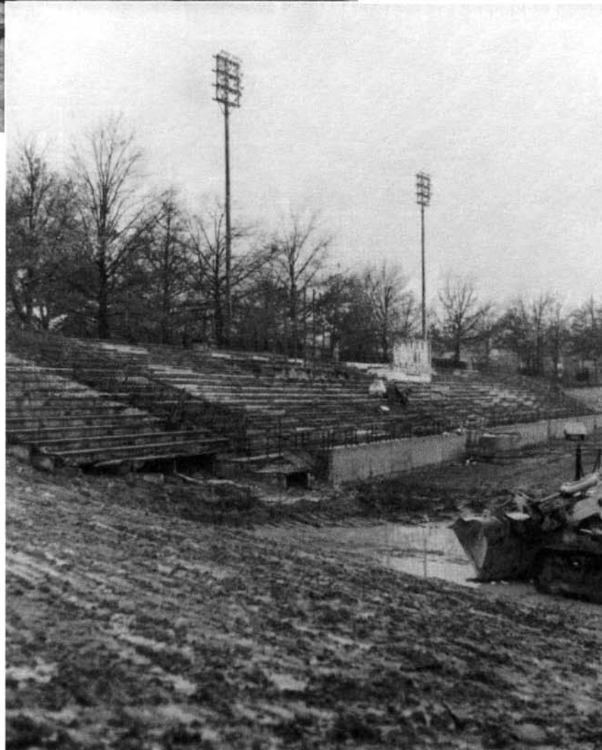
The East wing was removed in 1983.

Shot of Stadium on South side (with old Washington University Press Box in white) taken November 15, 1983, the day before bulldozers arrived to remove the concrete. The track was original third mile, cinder track, perhaps the last in a United States college. The wings of the Stadium on the East and West ends were removed. Although there were no permanent seats on the North side of the Stadium, in 1904 some spectators stood behind a fence to watch on the North side.