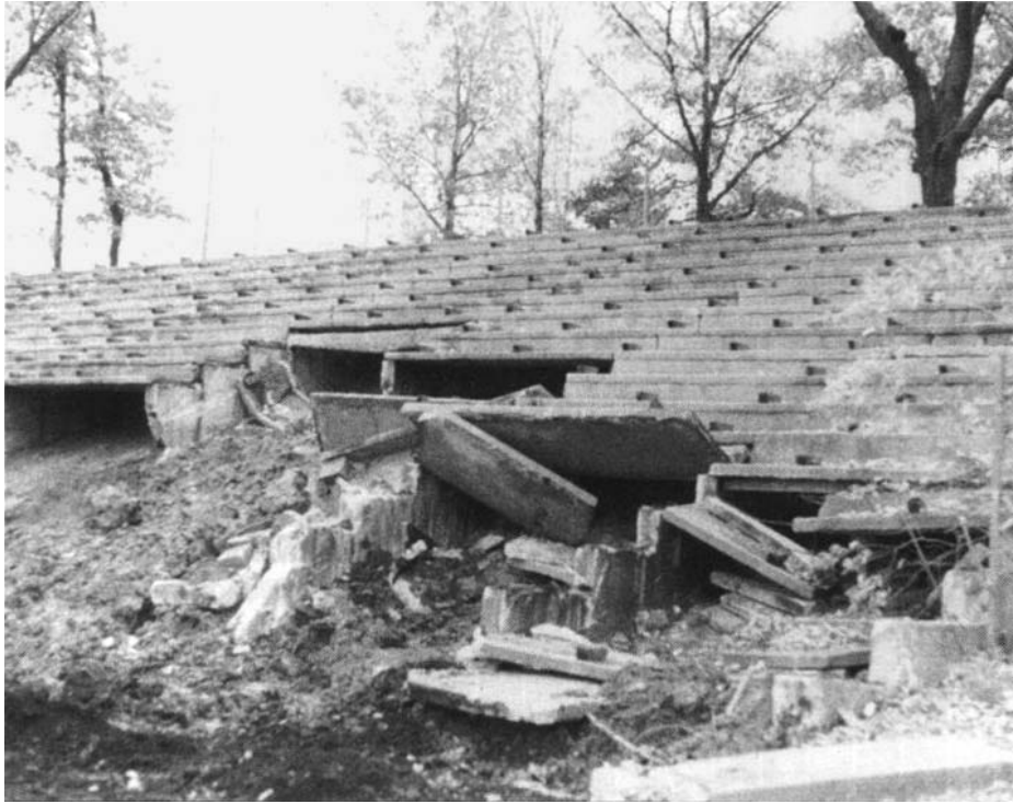
Close-up of renovation in 1983. (top)

These gates were erected on the East side of the Stadium in 1914 in honor of David R. FRANCIS, who was President of the Fair. James E. SULLIVAN was named "Chief of the Department of Physical Culture", which was selected to handle the Games. He had been assistant chief of the department in Paris in 1900. Francis was named Ambassador to Russia in 1917. The gates still stand.