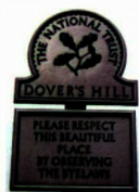
The National Trust has owned and looked after Dover's Hill since 1929.