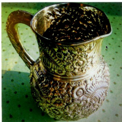
Silver pitcher from Tiffany with initials of Theodore Roosevelt; donated to Pierre de Coubertin 1886.