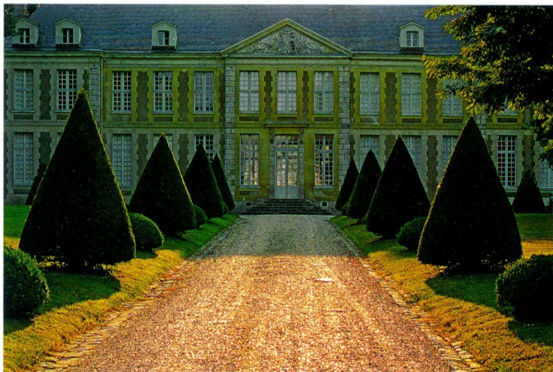
De Coubertin's castle at Saint-Rémy-lès-Chevreuse near Paris.