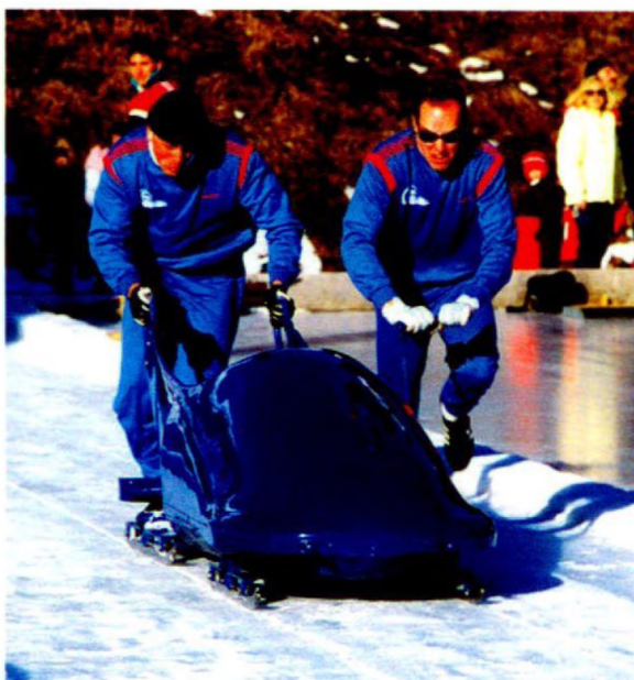
Prince Albert learned bob-racing at a training course run by Olympic Solidarity and took part in five Winter Olympics from 1988 to 2002. Since 1985 he has been a Member of the IOC and has also succeeded his father Rainer as Prince of Monaco Albert II.