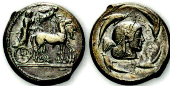
A charioteer driving a quadriga under flying goddess Nike, who crowns the horses, was a typical motif on Syracusan coins during the reign of Hieron I, an Olympic champion.

Many cities ruled by aristocratic families had lost the official name of monarchies although kept most monarchic characteristics, so some aristocrats who competed cannot be strictly considered as royal Olympians. Sparta was a powerful state that maintained the term monarchy as its constitutional regime for many centuries. Spartan King Demaratus became Olympic champion in 504 BCE thanks to his fast chariot and horses. Spartan monarch Agesilaus II, whose reign began at the beginning of the 4 th century when Sparta was the most powerful Greek state, wanted to show the strength of his kingdom in the place where all the Greeks met every four years: Olympia. According to Xenophon and Plutarch, he encouraged his sister Princess Cynisca to take part at the 396 BCE Olympic Games in the chariot races. As a woman, her attendance at the event was forbidden. However, her chariot won so Cynisca became the first female Olympic winner ever. She competed four years later and won again. 5 During the