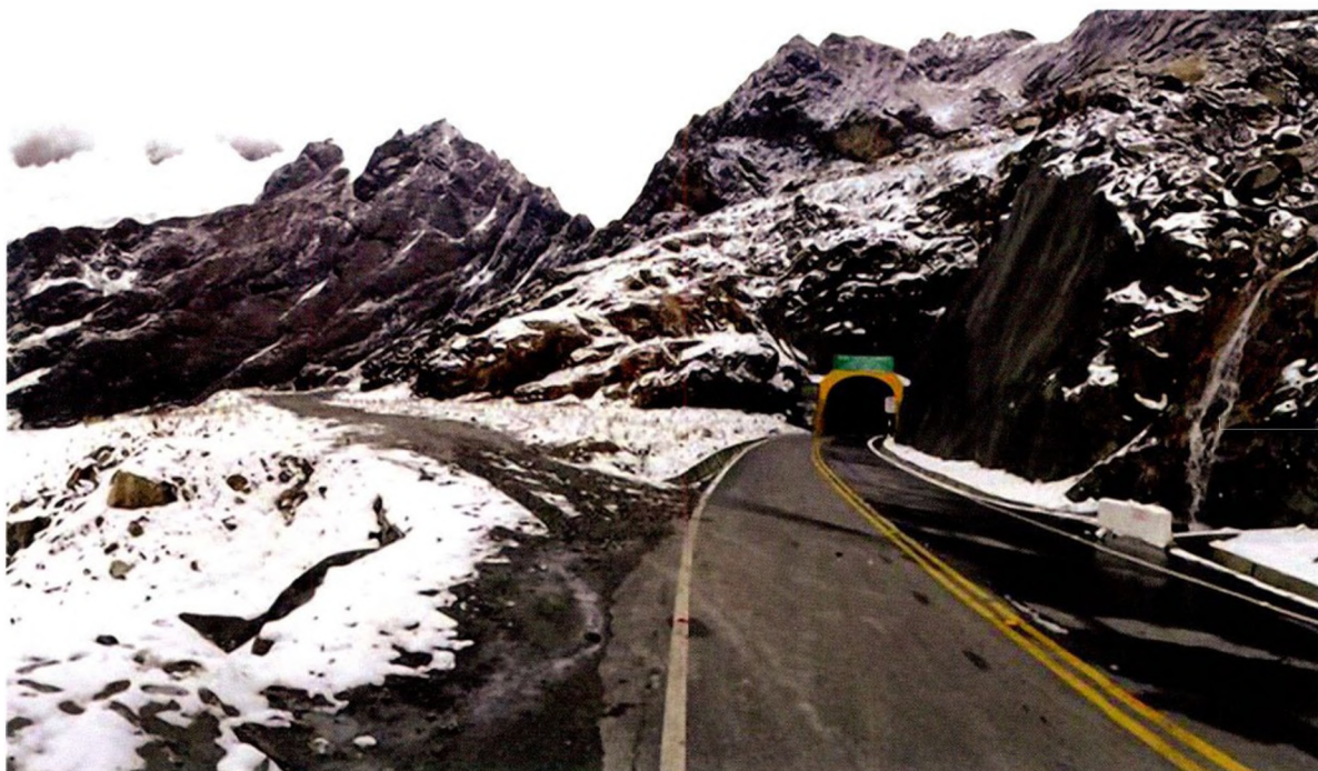
The Olympic tunnel in the Cordilleras, which was inaugurated in 2013. At 4735 metres above sea level it is the highest tunnel in the world. The first tunnel was opened in 1984, but soon had to be closed again because of the danger of avalanches and falling rocks.