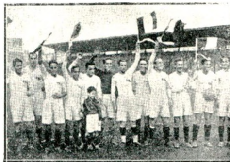
EL EQUIPO DE “CHILE-PERU”

La clase del combinado suramericano del Pacífico asegura un gran match, si halla correspondencia, en el equipo azul-grana