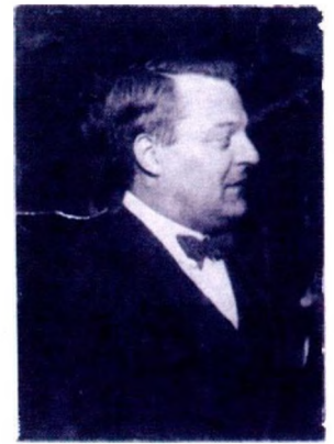
15. Jan. 1941 Wien 2029