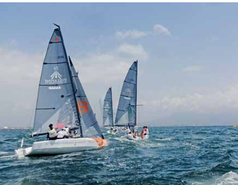
Sailing was held in the Bay of Naples, which had previously witnessed the Olympic regatta during the competitions of 1960.

The centrepiece of the first Universiade was an arena now rechristened "Stadio Comunale". The programme featured athletics, basketball, fencing, swimming, diving, tennis, volleyball, and water polo. The Opening Ceremony was held by night and featuring students in medieval costume.