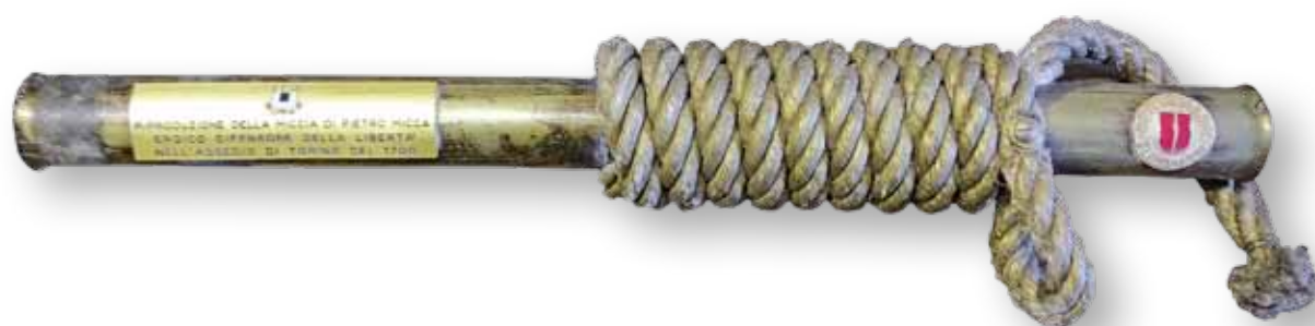
The torch used for the 1970 Universiade in Torino.

In the autumn of 1958, Torino was selected to host the 1959 Games. 6 A leading figure in the organising committee was Primo Nebiolo, later to serve as FISU President and also lead the International Amateur Athletics Federation from 1981 to 1999. According to the official report from 1959, "The preparation period was in our opinion a little too late for obtaining any great success at all." 7