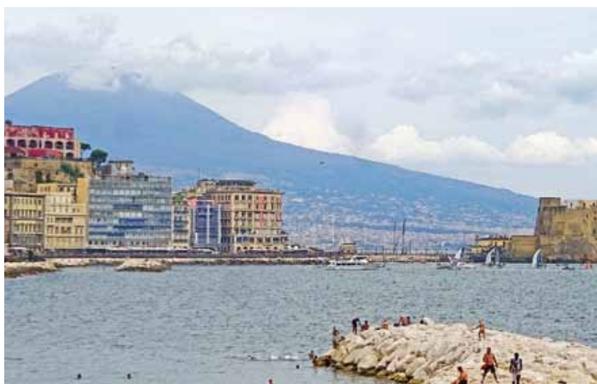
Vesuvius looms in the background as sailing boats arrive at the finish of the Universiade regatta.

When peace returned, the Italians reorganised their domestic university sport and supported the foundation of the FISU. In 1949 they hosted an international week