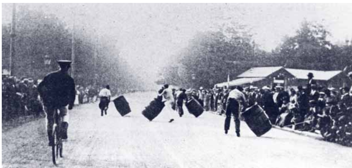
The 1900 World Expo was a mixture of sport and popular entertainment. The barrel rolling finals attracted many visitors.

He was forced to come to terms with the fact that there was no mention of "Olympic Games" on any of the posters for the "International Competitions of physical