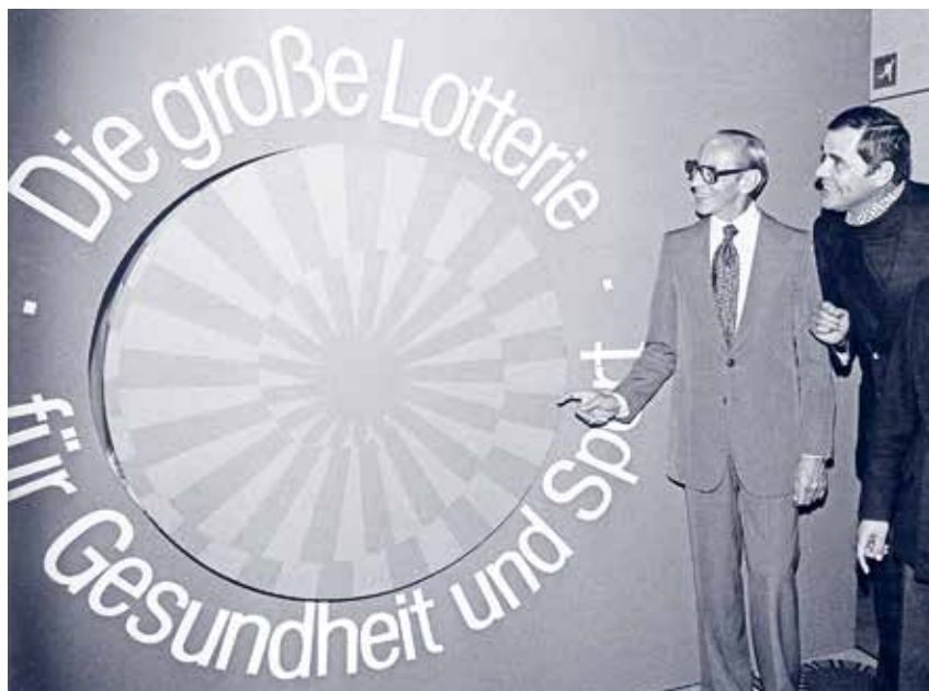
One turn to make a million out of five German marks. Josef Neckermann (left), Olympic champion in dressage from 1964 and 1968 and chairman of the German Sports Aid Foundation, made himself available as a “bearer of glad tidings”.

The logo’s success story did not end there. After the Olympic Games, the “spiral of luck” lottery was used to raise funds for the 1974 World Cup. After a year-long break, it was revived and spins and spins to this day. The large revenue it generates helps to fund German sports, social associations, and the protection of historic monuments. The logo has certainly proven its worth over the long term. ■