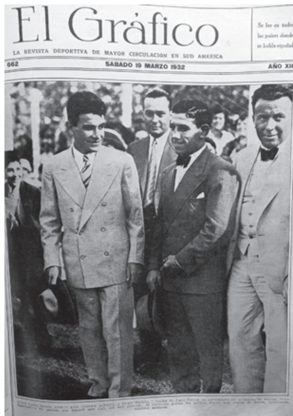
Juan Carlos Zabala (left) and Alexander Stirling (right) as guests at a Racing Club football match in March 1932.

When he saw the British runner Sam Ferris overtaking Zabala, Stirling made his way back to the stadium