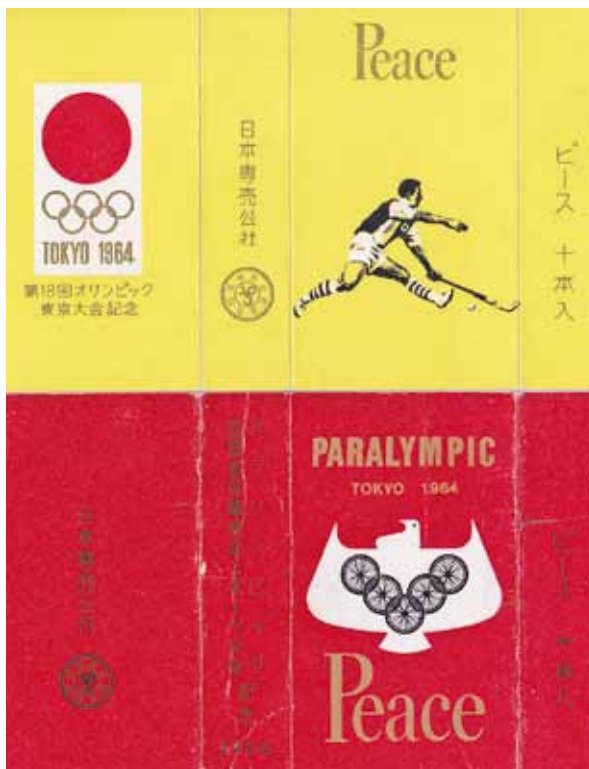
Cigarette packets from Tokyo 1964

The opponents to the use of the word parallel saw it as a contrived definition in order to preserve the status quo of spinal cord injured dominance, as the Olympic Games and Paralympic Games are never at the same time. Eventually, the definition of the name, running 'along similar lines to' has been universally accepted.