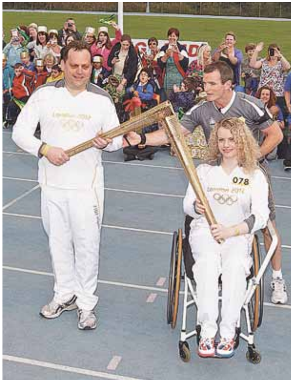
The Olympic flame also stopped in Stoke Mandeville in 2012 on the way to London.

real disappointment that there was no contemporaneous programming, given the millions spent on the Olympics in Moscow.