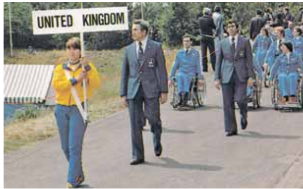
The Parade started for the British team in 1980. Far left: Rome 1960: The Dutch team relaxes out of the heat in the accommodation undercroft: no elevators, stairs on the right!

Dutch personality of liberality on the one hand and strict adherence to rules on the other.