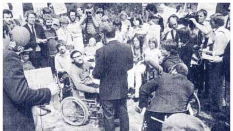
Demonstration by disabled people against South African participation in the Stoke Mandeville Games 1981.

The year after Arnhem, the International Games found themselves under similar pressure to that which faced the Dutch Parliament and Organising Committee. So much so that, at the ISMGF Council meeting of that year 1981, the future participation of the South African team was suspended although they retained their membership. Possibly the demonstrations outside the gates of Stoke Mandeville during the International Games, running at the same time as the Executive and Council met, added to the pressure to suspend.