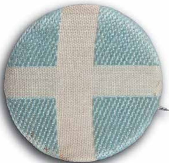
Hand made cloth pin for Greece in 1896 – the first National Olympic Committee Pin in the history of the Olympic Games. The diameter of the pin is 23 mm.