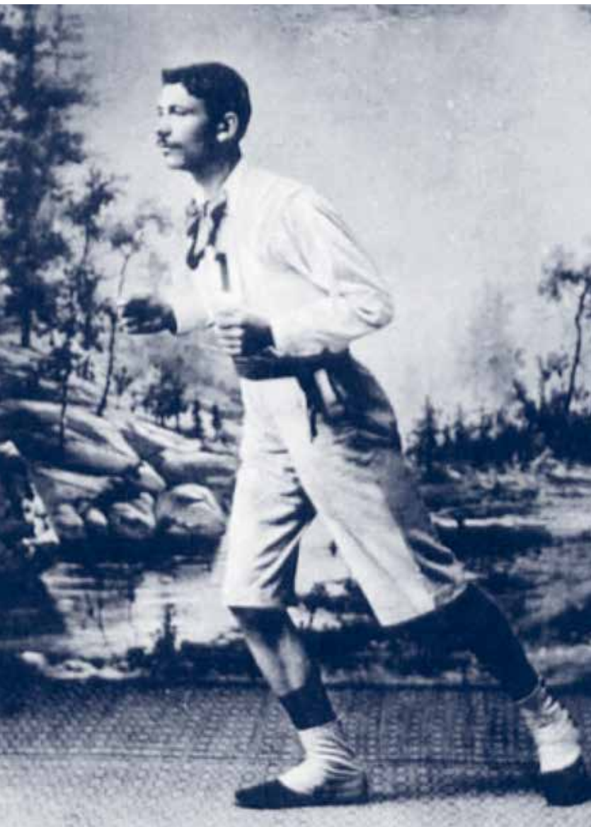
Charilaos Vasilakos, the first athlete to win a marathon race. He won the Greek Preliminary Trial and was second in the 1896 Olympic event behind Spyridon Louis.